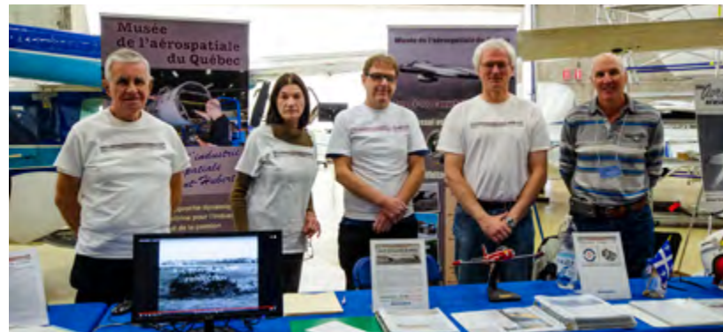
Some members of the QAM team during a presentation at the ENA.

6575 chemin de la Savane, Saint-Hubert, (Qc) J3Y 8Y9 Canada