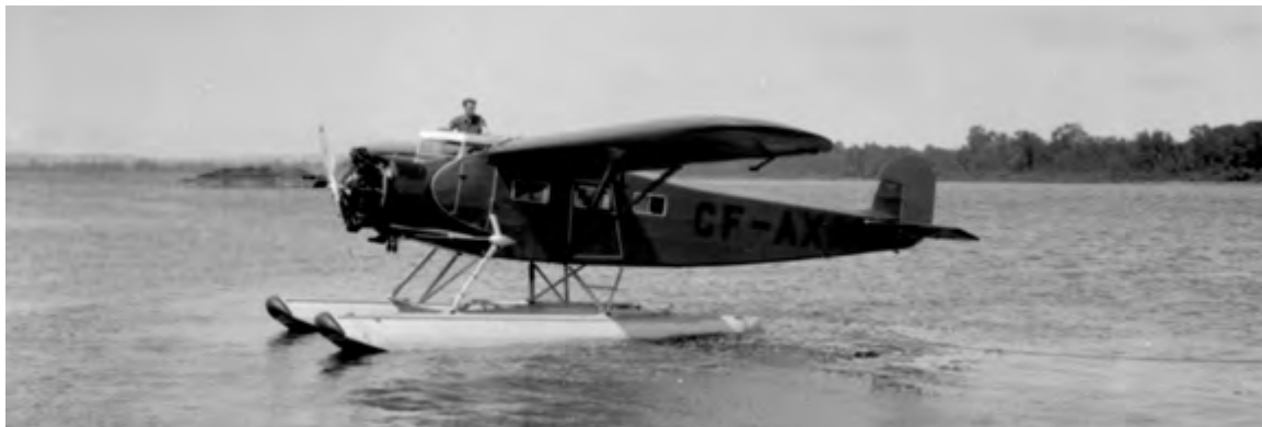
The restoration of a Fairchild 82 bushplane built in Longueuil in the early 1930 is also part of the intentions of the QAM.

Research and discussions are also underway to obtain a Sikorsky CH-124 Sea King helicopter, built in Longueuil that was recently retired from the Royal Canadian Air Force, as well as an Airbus Helicopters SA318C Alouette II helicopter used by Hydro-Québec to support the development of the important James Bay hydroelectric power plants in northern Quebec. That are now shaping Quebec's history and making it proud.