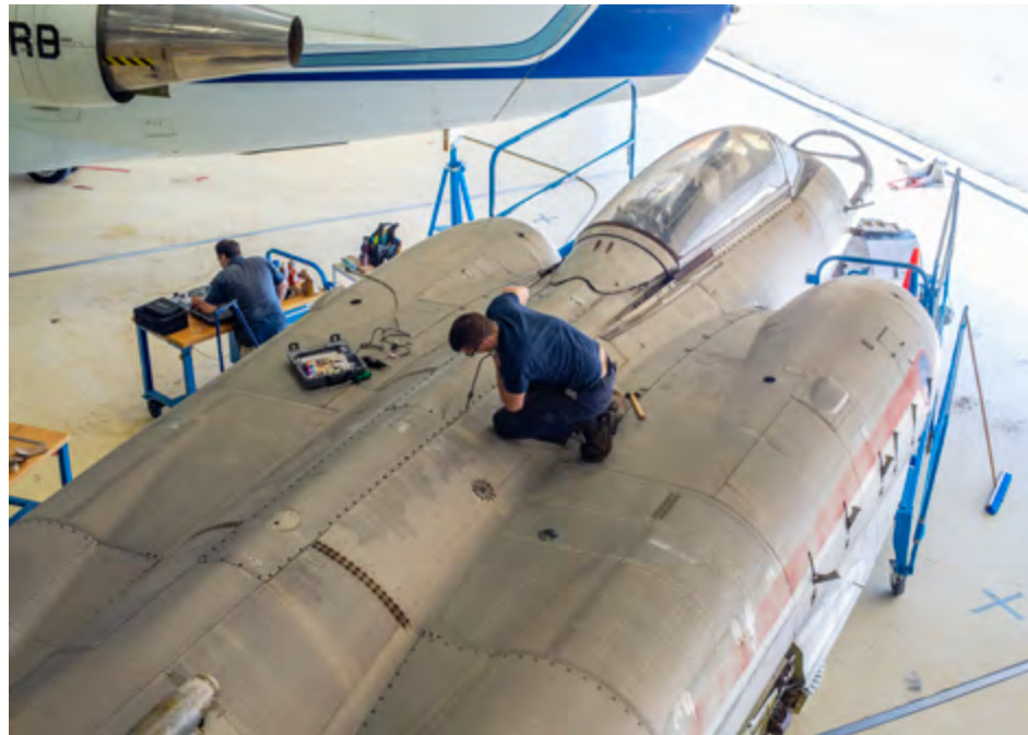
The restoration of the CF-100 #100760 remains a priority for the future at the QAM (photo Pierre Gillard).

This is why the organization is committed to ensuring the strict use of its resources while continuing to offer historical content as optimally as possible and community involvement that is up to the level that the public and industry are entitled to expect.