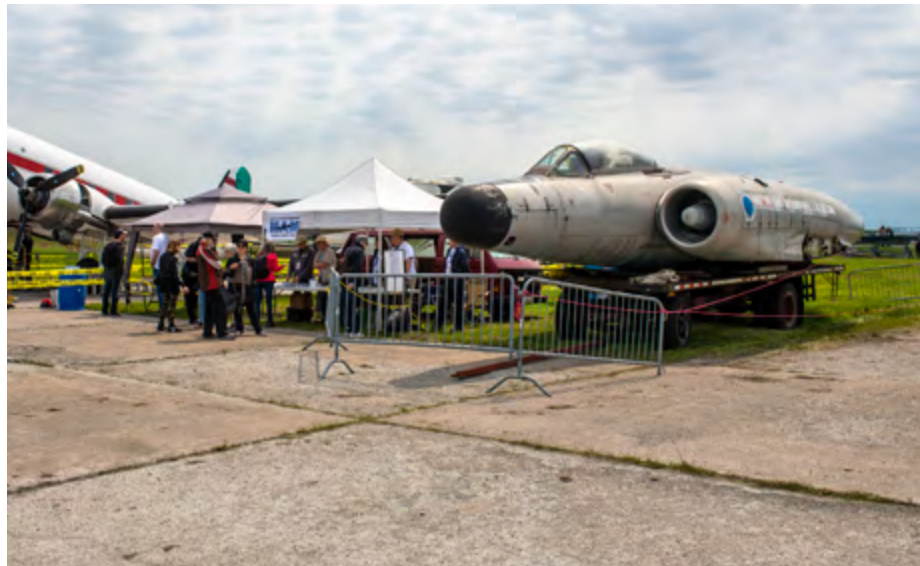
The fuselage of the Avro CF-100 Canuck 100760 of the QAM is displayed alongside the DC-3 C-FDTD of the Plane Savers team during the Aerosalon in June 2019 at Saint-Hubert airport.