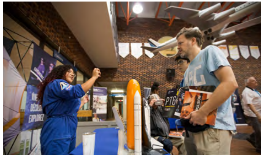
The Canadian Space Agency booth attracted interest from visitors on Aerospace Heritage Day.